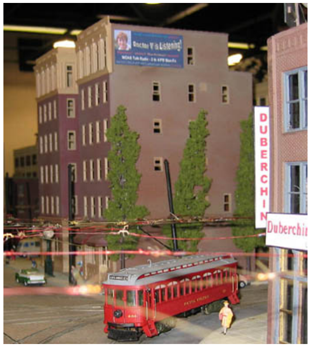
Elsewhere downtown, C&LE 648 with its train passes PERy 1221 at the mid-town crossover.

Meanwhile, there was action downtown on the Southern California Traction Club layout as a Mount Lowe car left the main line heading for its destination: