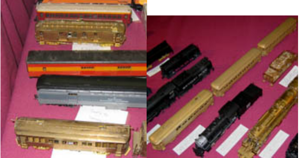
As a side note, it was clear from the attendance that many brass aficionados preferred to watch football or surf ebaY but all of these people missed a fine show. Hope to see you all next year!